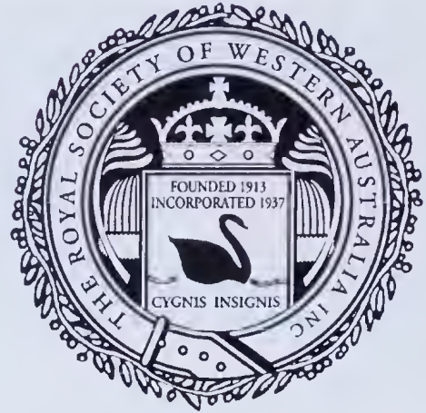
Figure 7. Revised crest of the Royal Society of Western Australia, 1997.